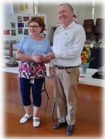
Below: Some of our lovely members at Pohlman's.